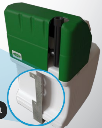
Integrated easy connect wall bracket